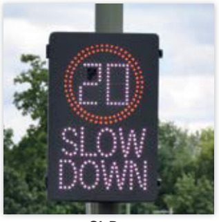
SLR Speed Limit Reminder

We have created our Vehicle Activated Speed (VAS) signs to be as user-friendly as