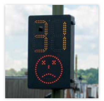
SAM Smiley Activated Message*

are priced the same, meaning there is no price barrier between your desired type of