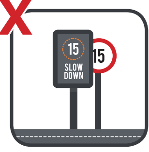
Do not obstruct any pre-existing road traffic signs