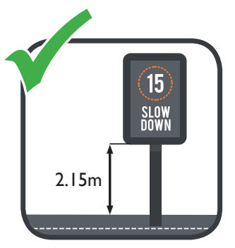
2.15m minimum air space between the base of the sign and the ground