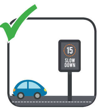
Must be clearly visible to approaching traffic, preferably on a clear, straight road