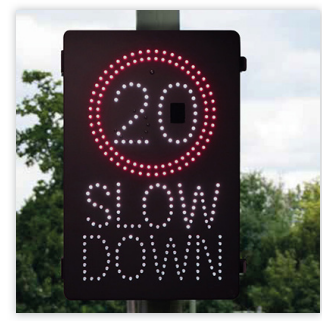
20/30 Urban Speed Sign

The Urban VAS is able to display 20 or 30mph speed limit reminders and is accompanied with TSRGD numerals and symbols to keep up to date with the consistency of the UK Highways.