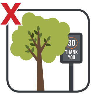
Avoid placing underneath overhanging trees/hedges, especially if using solar panels